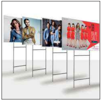
PVC Board Glass (with white)